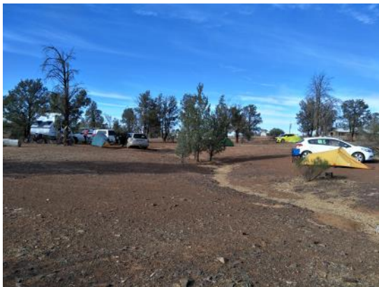
Above: Our Exceptional Camp Ground at Angorachina Station.

We arrived at Angorachina Station which is located in the Flinders Ranges region of South Australia. Angorachina Station is South East of Blinman and is a property which is 1500 thousand square acres in size and we were greeted by the property owners Alice and Ed who welcomed us onto their property.