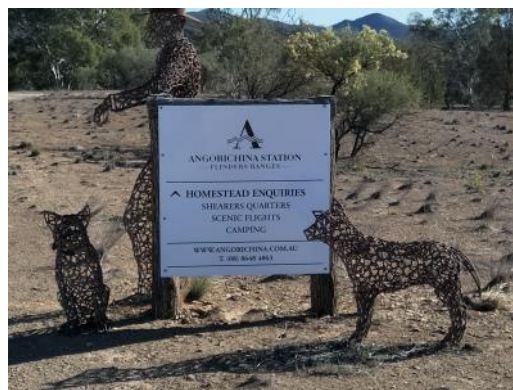
Left: Lunch Stop at Donkeys Gully Bore, again note the dryness and lack of vegetation due to the drought conditions.