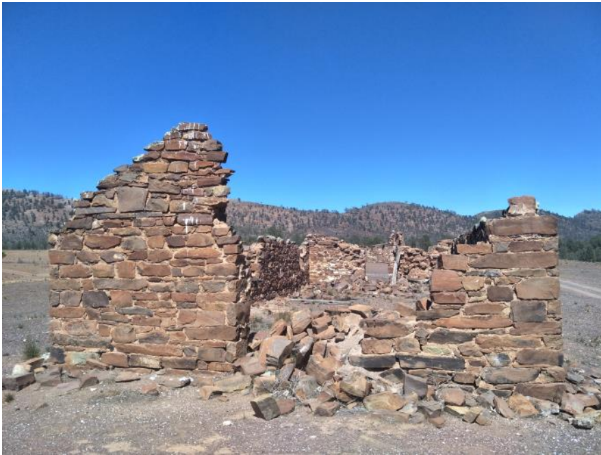
Above: Artimore Ruins and artifact of our past.