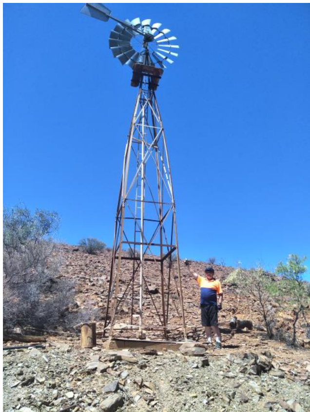
Above: Donkeys Gully Bore / Well