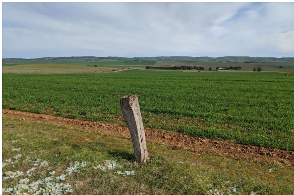
View across the valley

This creek joins the Hutt River and we rode along the Hutt River Road, the Hutt Hill Road and the Hilltop Road while skirting the locality of Hilltown. Very imaginative local names!