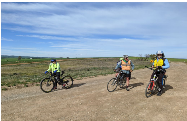
The crazies from the Big Smoke

Arriving at Andrews we toured the entire town for a few minutes looking for a rest stop. Eventually we decided that the long disused Tennis Club had the best seating, a low crumbling concrete curb. When we stopped talking the utter silence rolled in with just the barest whisper of bird song. Soon though the suspense grew too great and a couple of locals took to their utes and trundled slowly by to check us out.