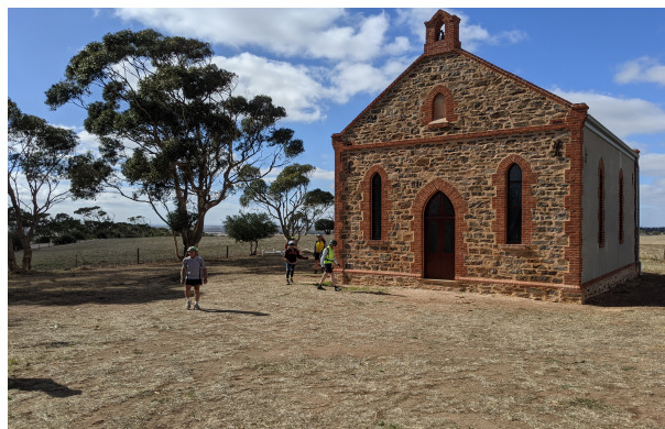
Wesleyan Church: Is someone looking down on us?