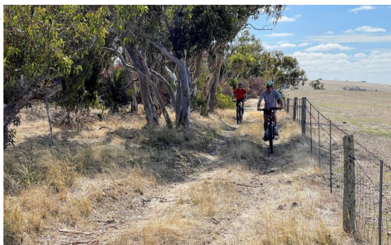
Haines Road: In a rut.

Having plenty of points left on our bicycle licenses we took the turn and braved a rough, debris strewn two rut track with numerous sandy stretches that tested our soft surface technique and resolve.