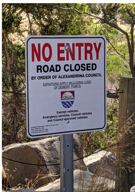
Sign, sign, everywhere a sign.